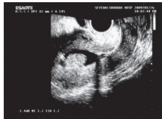
Fig 2: Hysterosalpingography shows a clearer image of a large echogenic polyp in the endometrial cavity.