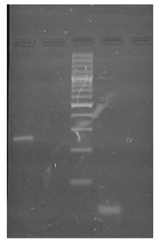
Fig 2: PCR products of plasmid

A 2% (w/v) agarose gel showing the PCR product. DNA from patients with negative MOMP, and \beta -globin alleles yielded 149bp, and 268 bp products, respectively. The absence of MOMP (in the presence of \beta -globin PCR product) indicates the respective null genotype. Samples, positive for all three PCR products, were considered 'Nonspecific bands (1-3). Line 4: negative control, L: Molecular weight marker and line 5: positive control 144 bp.